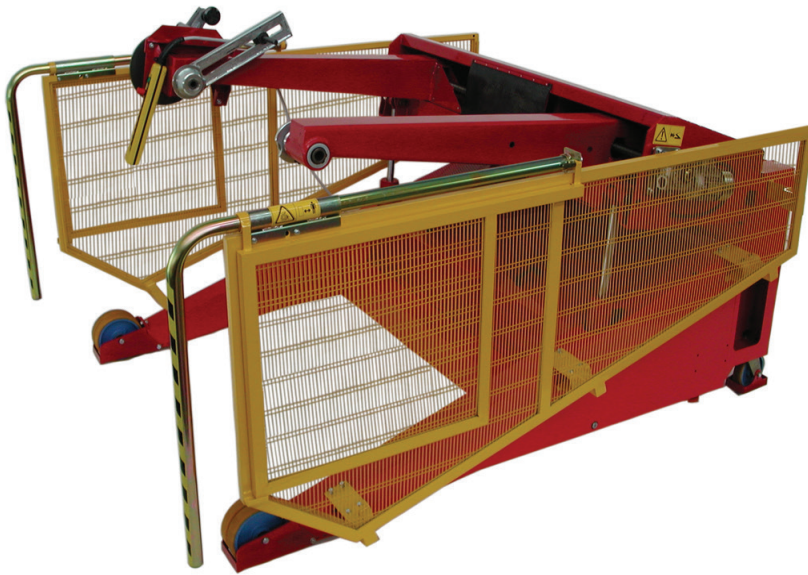
CD-15 / CD-22 / CD-40 / CD-100